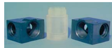
Zelux Machined Components