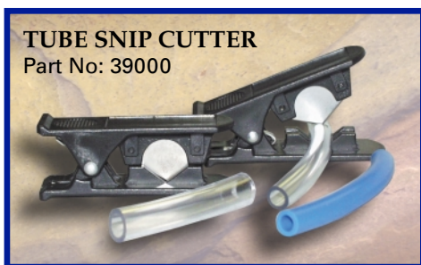
TUBE SNIP CUTTER Part No: 39000

BEV-A-LINE IV & V HT can be custom fabricated into coils, bends and angles to reduce connector problems and stress cracking of tube walls and fittings.